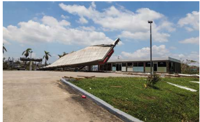
Destruction of petrol station caused by Tropical Cyclone Winston, Island Viti Levu, Fiji.

Payments were made directly into the bank accounts of the recipients. To do this, the Provident Fund linked up with a mobile network operator, Vodafone Fiji, and set up a cloud-based operation through which all incoming calls were routed to Vodafone's call center, which then forwarded selected calls to the Provident Fund. This partnership also enabled the call center to provide updated information to members.