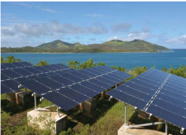
Solar PV modules Fiji.

The Sustainable Finance Roadmap includes related action items, such as developing environmental and social risk management guidelines, creating a legal definition of green products and collecting better data.