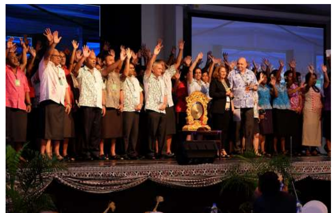
Closing ceremony, 2016 GPF, Fiji.