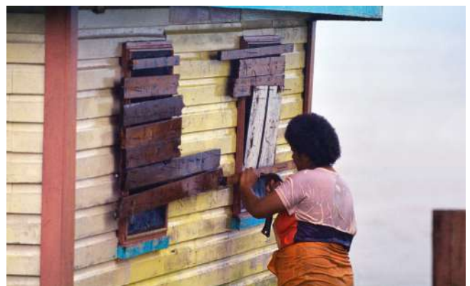
Woman boarding up her house during a Tropical Cyclone Winston.

There is optimism in Fiji that fostering financial inclusion will strengthen the resilience of the poor and ease the transition to a low-carbon economy. This case study examines the important link between financial inclusion and climate change and provides practical examples of RBF policies that are contributing to climate change mitigation, adaptation and resilience, greening the financial sector and laying the foundation for a low-carbon economy.