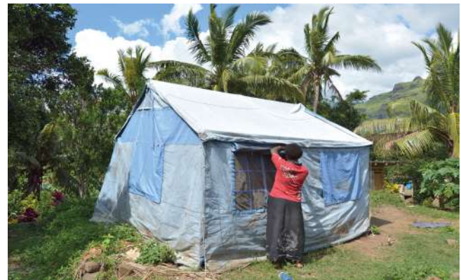
Victims of Tropical Cyclone Winston live in UNICEF tent in Navala village, Fiji.

The number of registered M-PAiSA users increased from 672,271 in Quarter 1 of 2016 to 707,193 in Quarter 2 and 754,939 in Quarter 4. Active users increased by 43% from 13,078 Quarter 1 of 2016 to 18,663 in Quarter 2. However, this fell once Phase 1 of the Help for Homes Initiatives ended in July 2016, and by Quarter 4 of 2016 active users stood at 15,812. 8