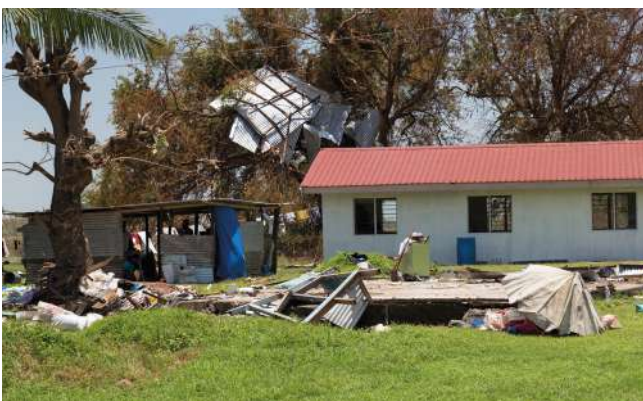
The effects of Tropical Cyclone Winston, December 2016.

Today, the RBF sees the development of green financial products and services as an integral part of its broader financial inclusion agenda and vital to Fiji's transition to a sustainable, low-carbon economy. The National Financial Inclusion Strategic Plan 2016-2020, developed together with the National Financial Inclusion Taskforce (NFIT), makes green finance a focus.