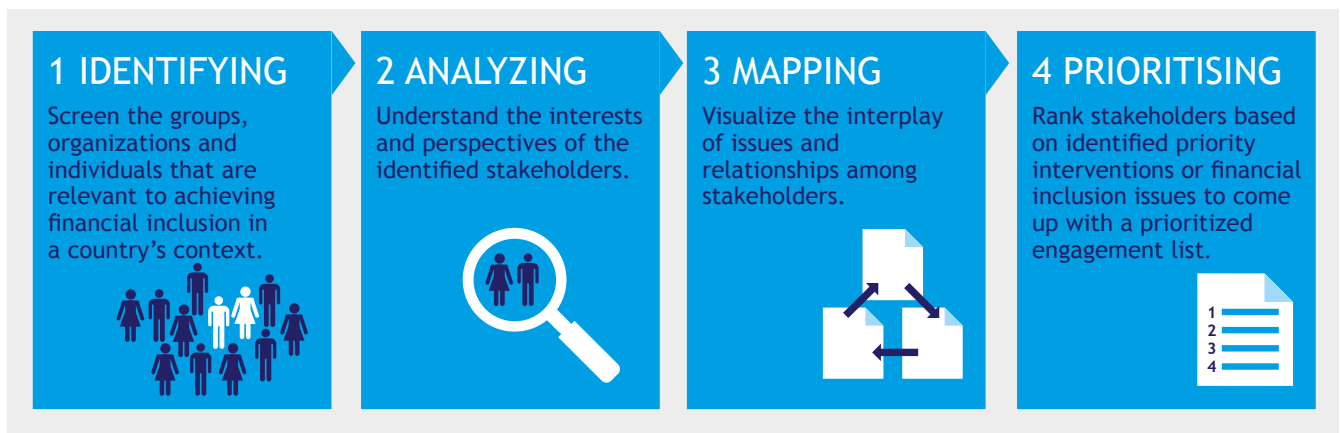
TABLE 1: STAKEHOLDER CLASSIFICATION