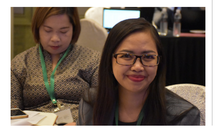
Participant from Bangko Sentral ng Pilipinas smiles for the camera during the Digital Banking Innovation session.