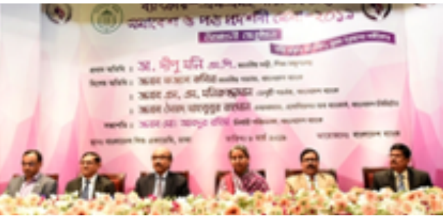
Picture2: Banker-SME entrepreneur meet