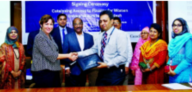
Picture1: Signing ceremony for Catalyzing access to finance for women entrepreneurs

The Bangladesh Bank with its all offices is mitigating SME-related complaints regularly through telephonic instructions, mails and if necessary, through onsite inspection. If entrepreneurs have any complaints against any banks or NBFIs they may communicate to the focal point of Bangladesh Bank. A SME monitoring cell is also working in each bank and NBFi.