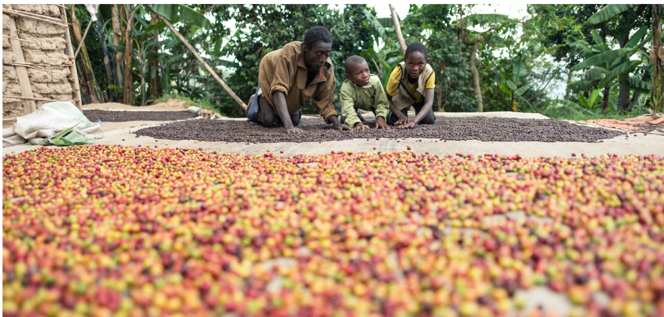
MSME spreading colorful coffee beans to dry them in the sun. Uganda.