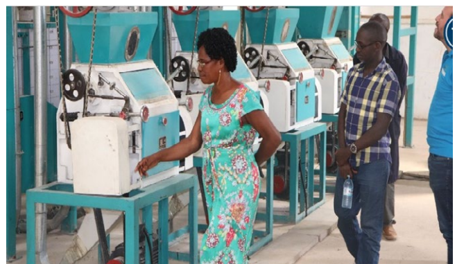
Kana Grain Millers, a miller of flour and supplier of edible oils, benefitted from the START facility for the importation of spare machine parts

By providing zero-interest loans, also known as reimbursable grants, the START facility provides a critical emergency response for MSMEs, assisting them in meeting their obligations on outstanding payments, production costs, salaries and related administrative costs that they are unable to pay due to the decreased cash inflow. This will ensure business continuity and sustainability during and beyond the COVID-19 crisis and will allow MSMEs to benefit from the START concessional lending at a later time. Kana Grain Millers, a miller of flour and supplier of edible oils, benefitted from the facility for importation of spare machine parts.