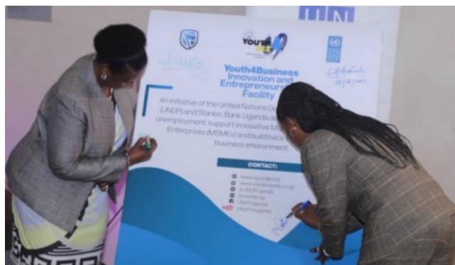
Participants at a Youth4Business Innovation and Entrepreneurship Facility organized by Stanbic Bank Uganda

Also, the Bank of Uganda, working with Stanbic Bank, through the Agricultural Credit Facility (ACF), commenced a block allocation of loans of up to UGX 20 million for farmers. These loans were made based on alternative collateral such as chattel mortgages, cash flow-based financing, and character-based loans, among others. This innovation has helped to solve the problem of access to credit in areas with communal land tenure and were especially designed for micro and smallholder farmers who are otherwise excluded from accessing financing for lack of collateral.