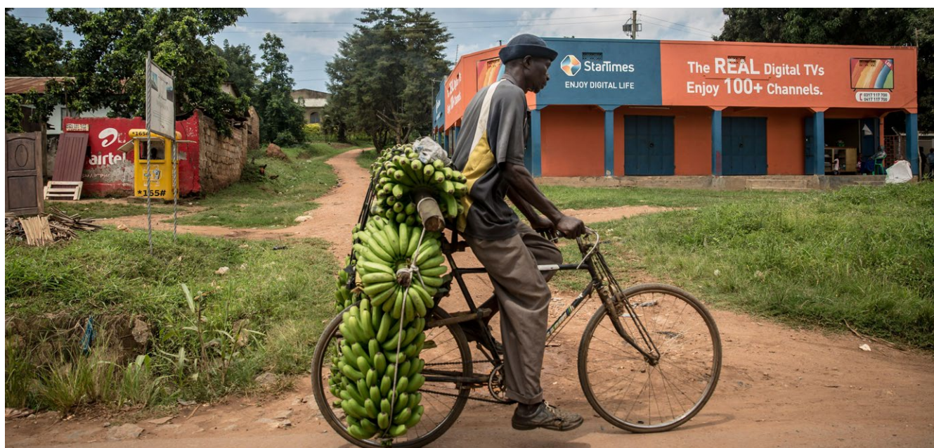
A nationwide transport ban was imposed in Uganda during the coronavirus crisis, in an effort to stop the spread of the pandemic, though bicycles and motorcycles were still allowed to transport cargo up until 5pm. Gulu, Northern Region, Uganda.