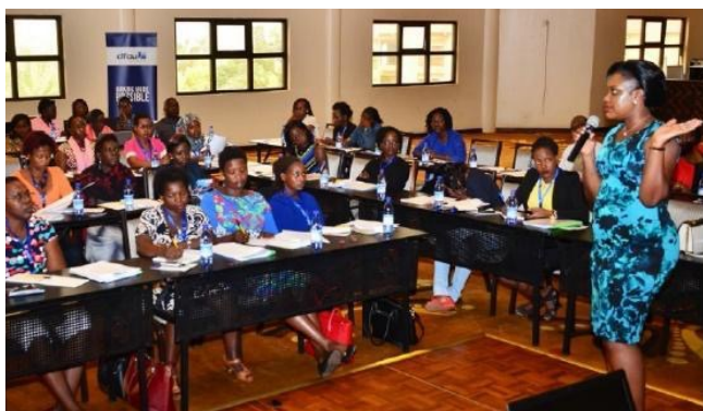
Plate 1: Financial literacy training for women.

These interventions are projected to roll out trade finance solutions such as unsecured bid bonds in excess of UGX 500 million to support traders and contractors in working capital management and securing agricultural contracts (Entebbe, 2020). Baraka loans have helped MSMEs to restructure their facilities and loans since mid-2020. This initiative has benefited 3,000 women, and over 19,000 women have so far registered for Baraka loans.