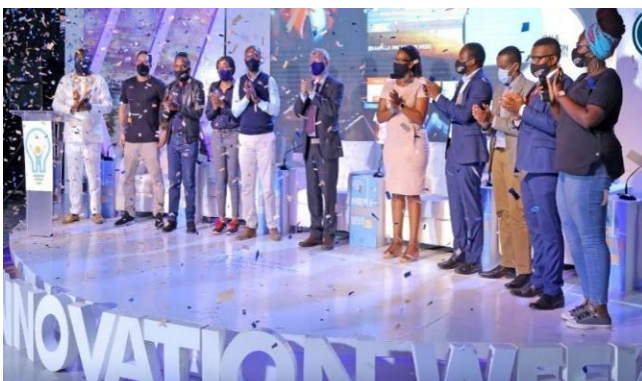
Participants at a UNCDF Agricultural MSME workshop

UNCDF partnered with local telecommunications providers MTN and Airtel to reduce e-business transaction charges and costs of doing business during COVID-19. A boot camp was hosted around digital innovation for entrepreneurs in the context of the pandemic.