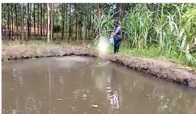
A fish farmer from Uganda (National Youth Champion).