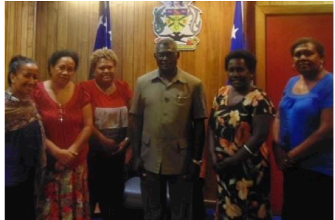
Honourable Prime Minister of Solomon Islands and SIWIBA Executive

She acknowledged that while all the highlights are positive signs of growth for SIWIBA, there is the issue of sustainability for SIWIBA after the funding term lapse in 2017.